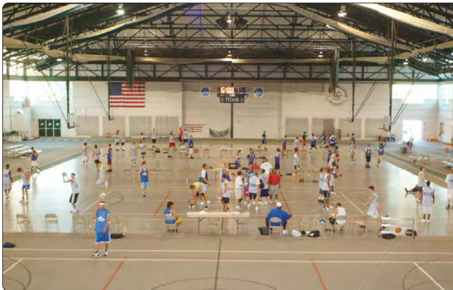
Shirk Center Fieldhouse (above) has 4 courts plus 3 additional. MSOE features 5 courts.

Campers from 26 states and five countries who attended last summer's camp played a series of games against top level competition.