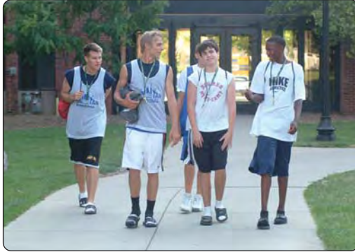
Campers head from the dorm at Illinois Wesleyan to the Shirk Center. A bit of trash talk livens up their stroll.